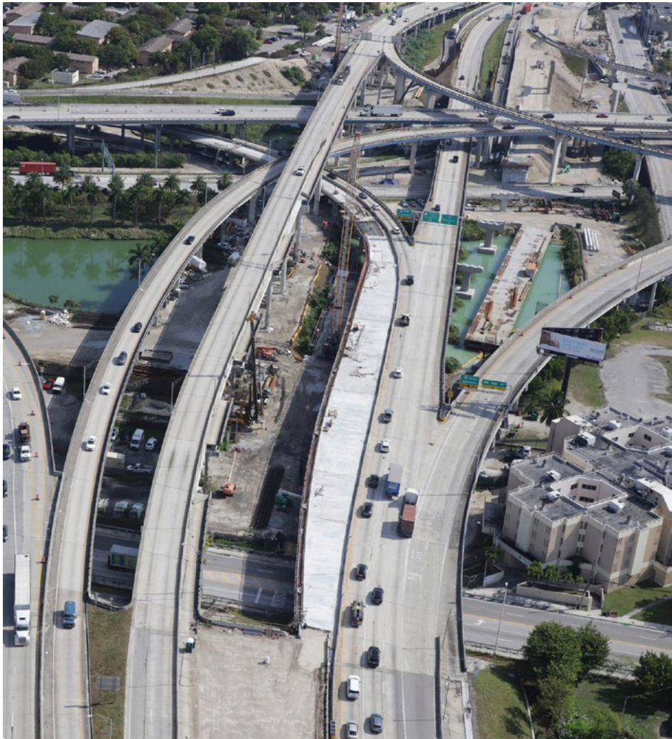
Ongoing widening of the eastbound SR 836 ramp to northbound I-95