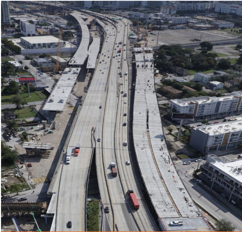
New I-395 eastbound and westbound segmental bridges under construction