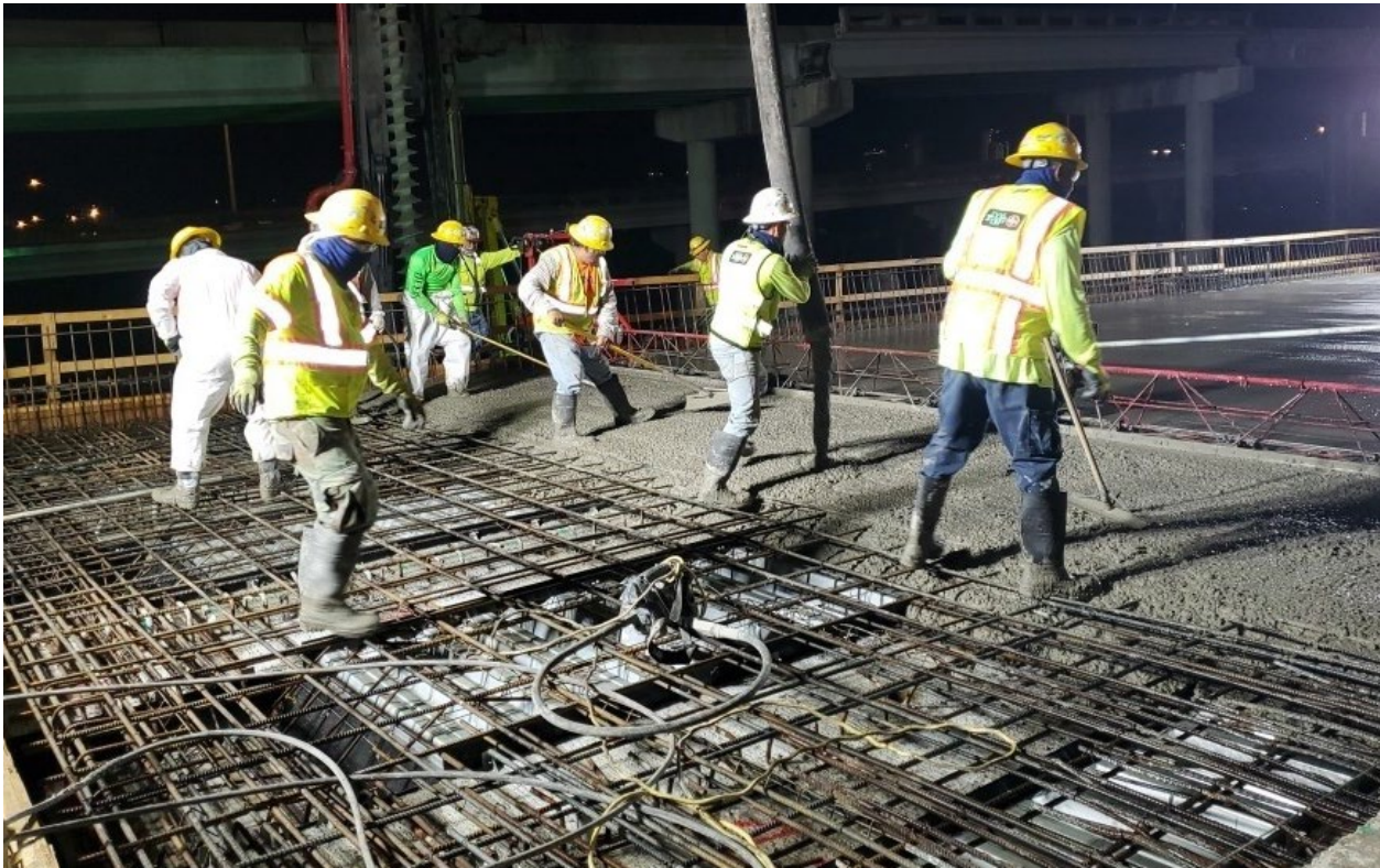
Nighttime concrete pavement replacement at the SR 836/I-395 ramps to northbound I-95