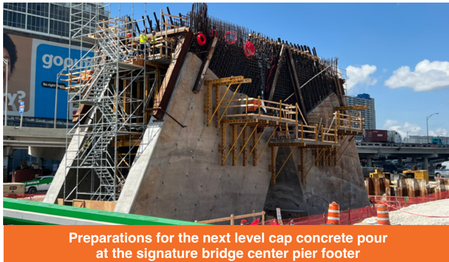
Preparations for the next level cap concrete pour at the signature bridge center pier footer