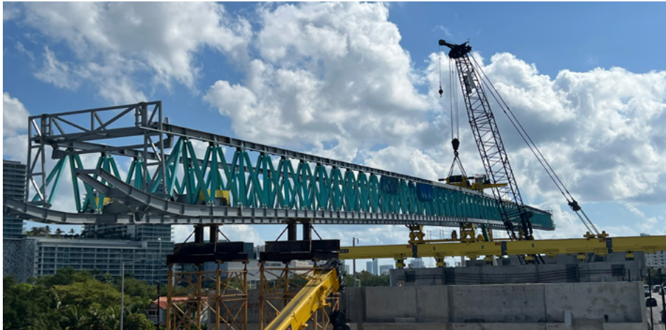
Ongoing assembly of the cap/beam lifter in the SR 836 median just west of NW 17 Avenue