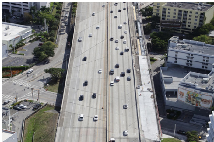
Ongoing widening of eastbound SR 836 from NW 12 Avenue to I-95