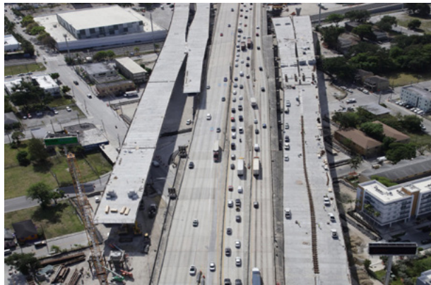
I-395 looking southeast with new eastbound bridges (right side) and westbound bridges (left side)