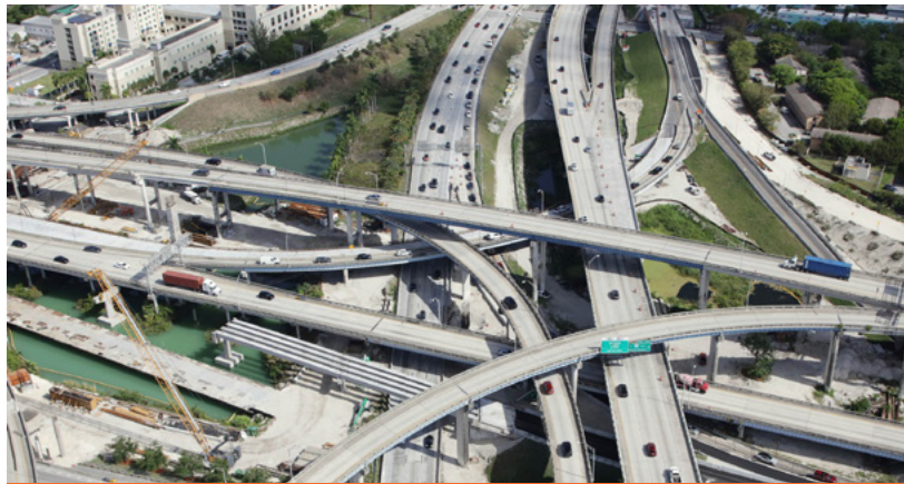
Core of the SR 836/I-395/I-95 Interchange showing ongoing bridge and roadway construction