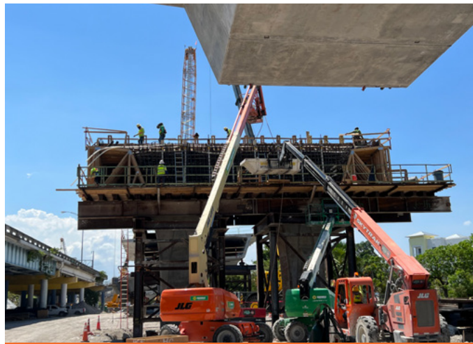
Crews working on a new pier for the future I-395 westbound roadway