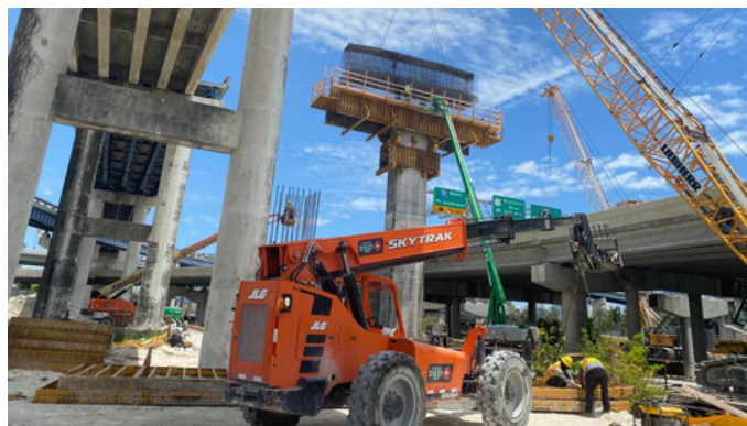
Pier construction for the new SR 836 double decked bridge