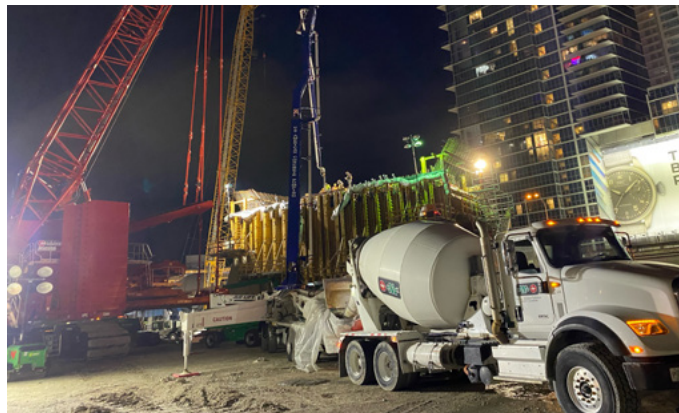
Concrete pour for the first cap level of the signature bridge center pier footer