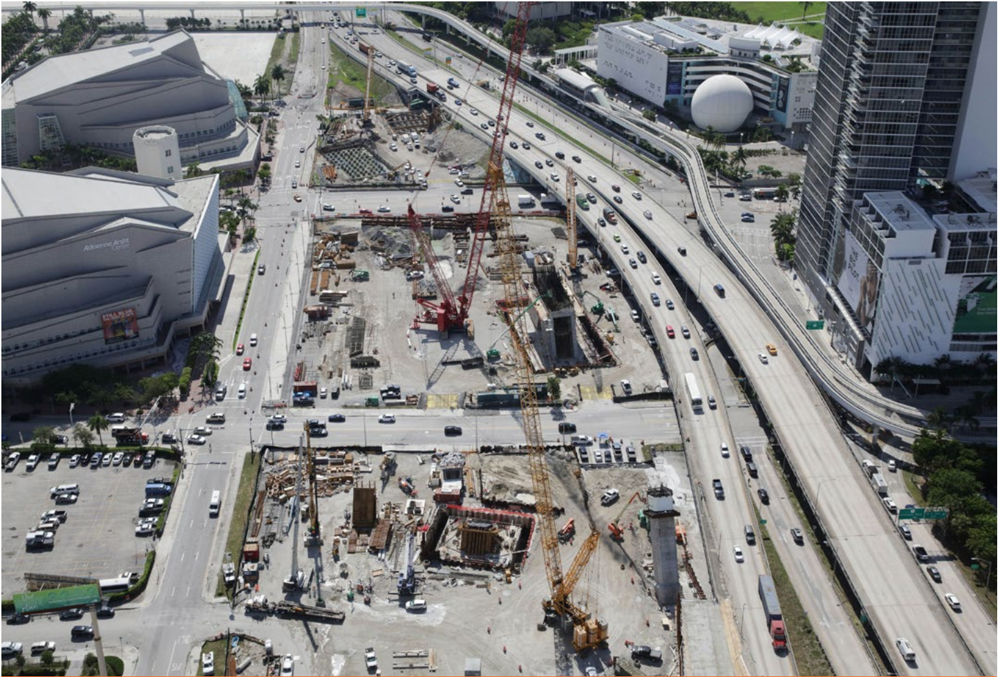
Footprint of the I-395 signature bridge showing four of the six arches and the center pier footer currently under construction