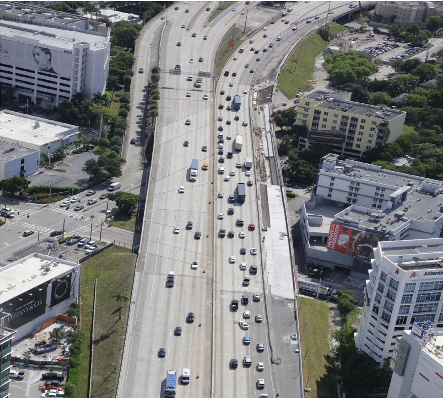
Ongoing bridge widening work on eastbound SR 836 from NW 12 Avenue to I-95