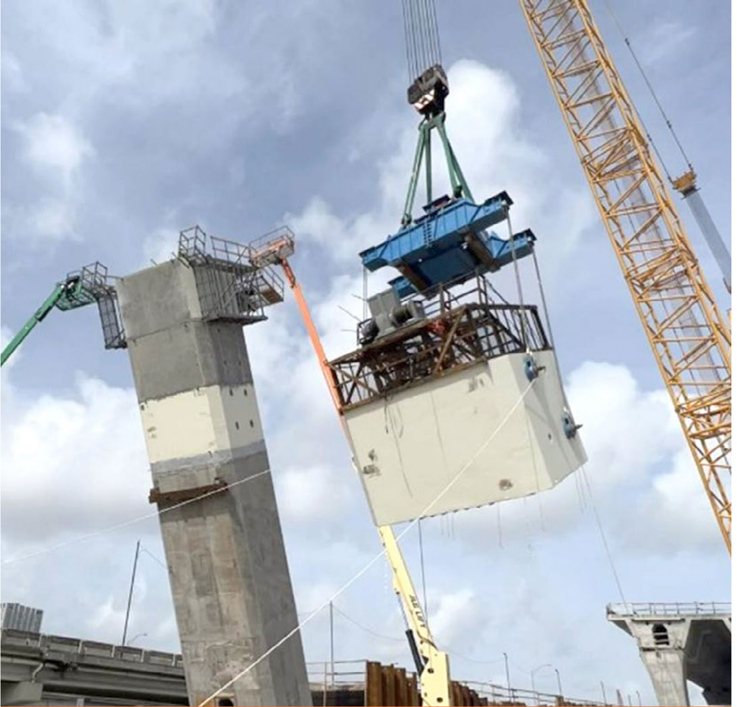
Installation of precast arch segment at one of the four arches currently under construction.