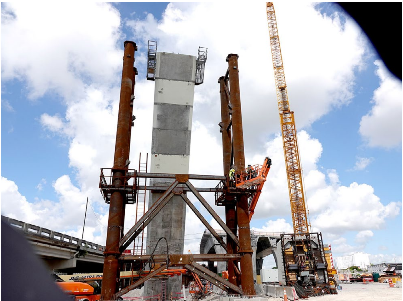
Construction of shoring towers to be used during the installation of pre-cast arch segments for the I-395 signature bridge