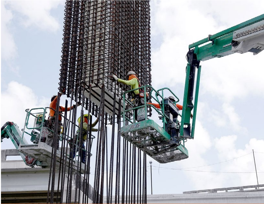
Crews installing reinforcing steel onto a new SR 836 pier at the core of the SR 836/I-95/I-395 Interchange