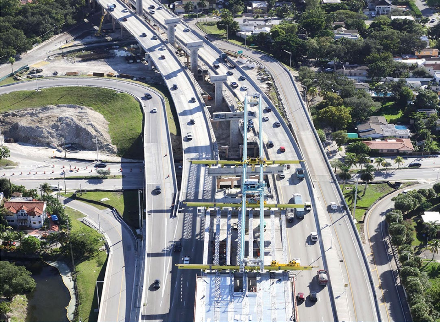
Ongoing construction of the new SR 836 double decked section using the cap segment and beam lifter