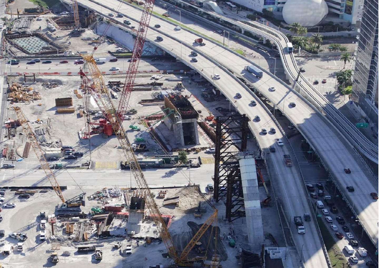
I-395 signature bridge footprint showing ongoing construction of the center pier support and arches