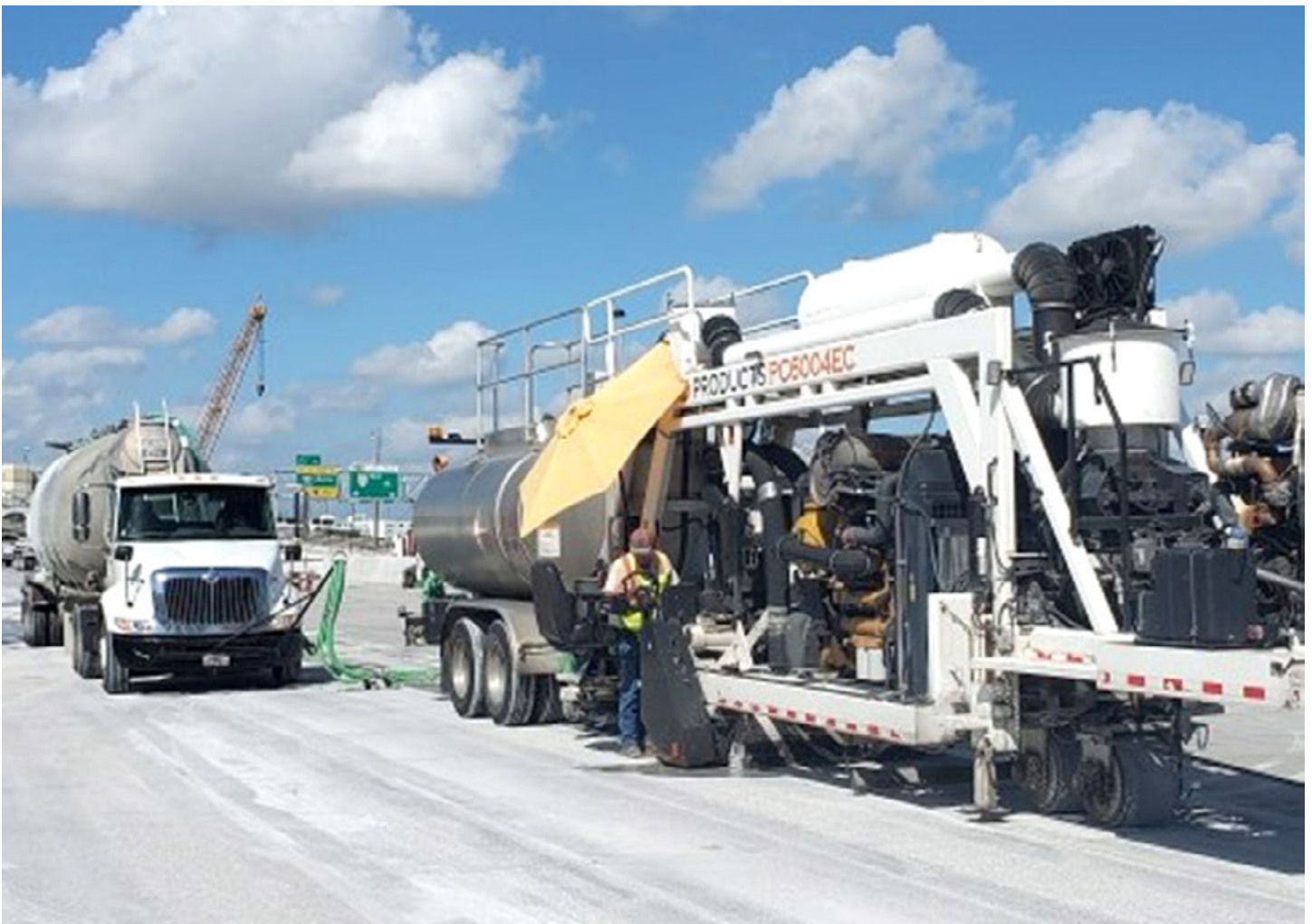
Diamond grinding of new I-395 bridge deck surface to ensure smooth surface.