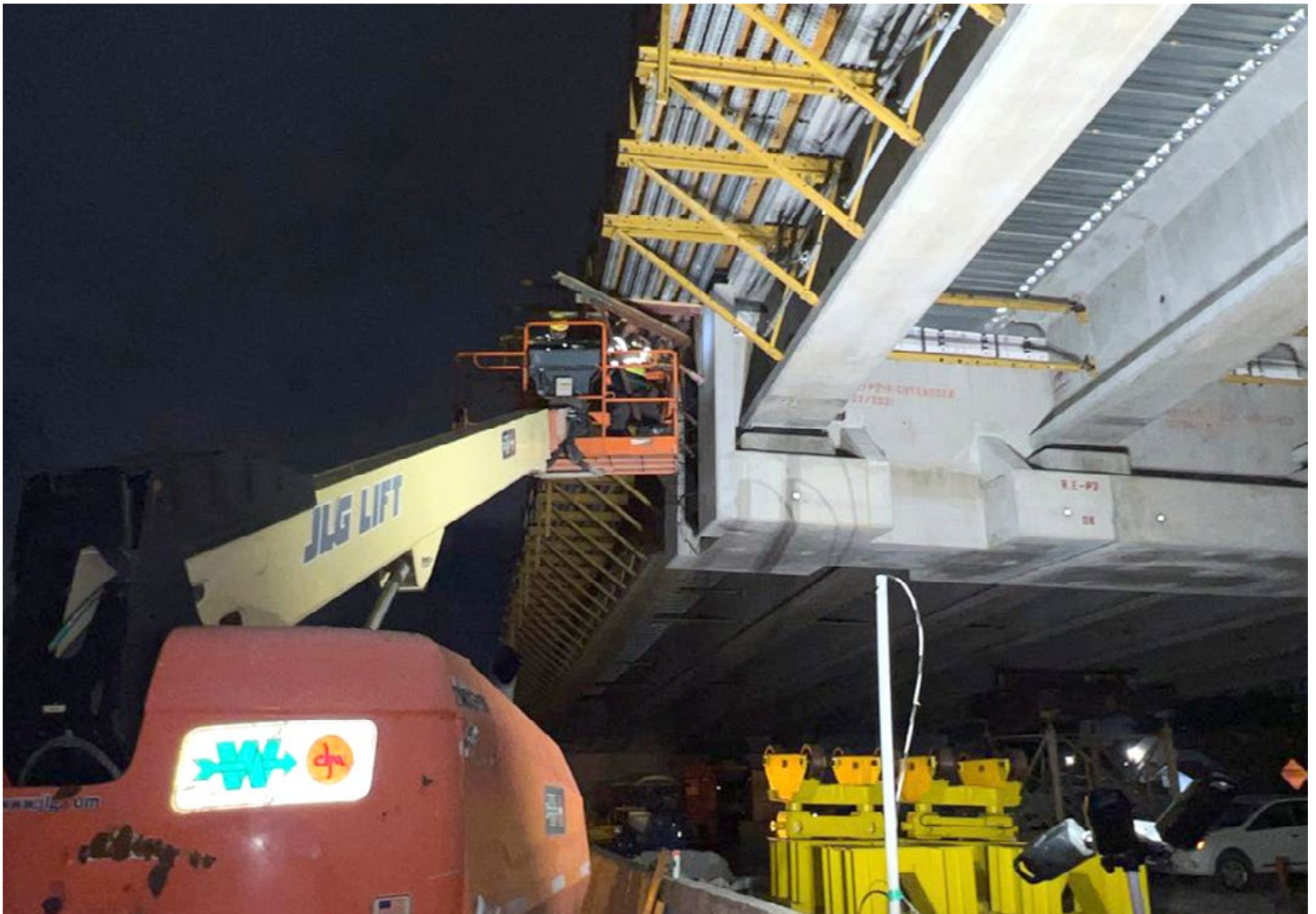
Installation of bridge overhang brackets at the new double decked bridge just west of NW 17 Avenue.