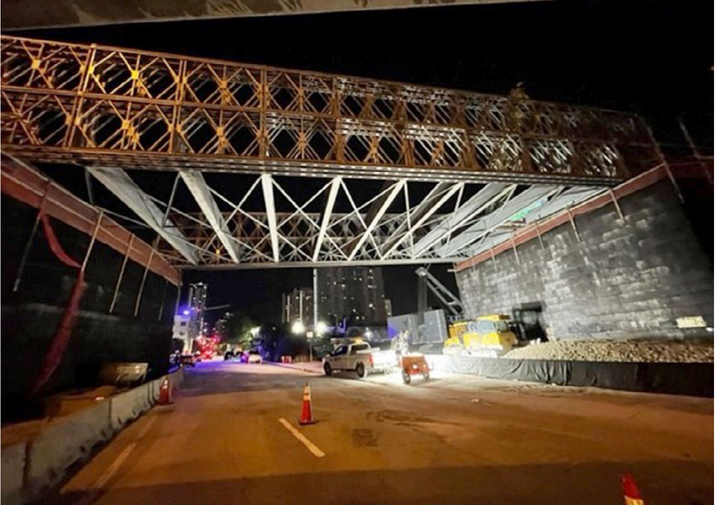
Installation of a temporary bridge over North Miami Avenue