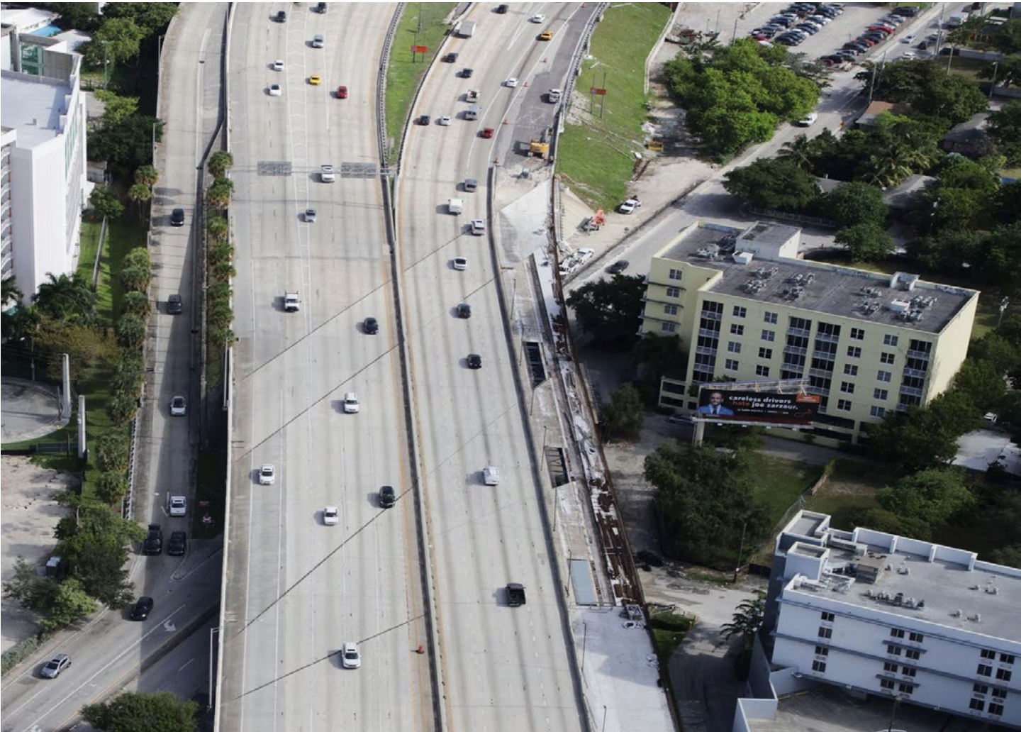
Ongoing bridge widening on eastbound SR 836 from NW 12 Avenue to east of NW 14 Street