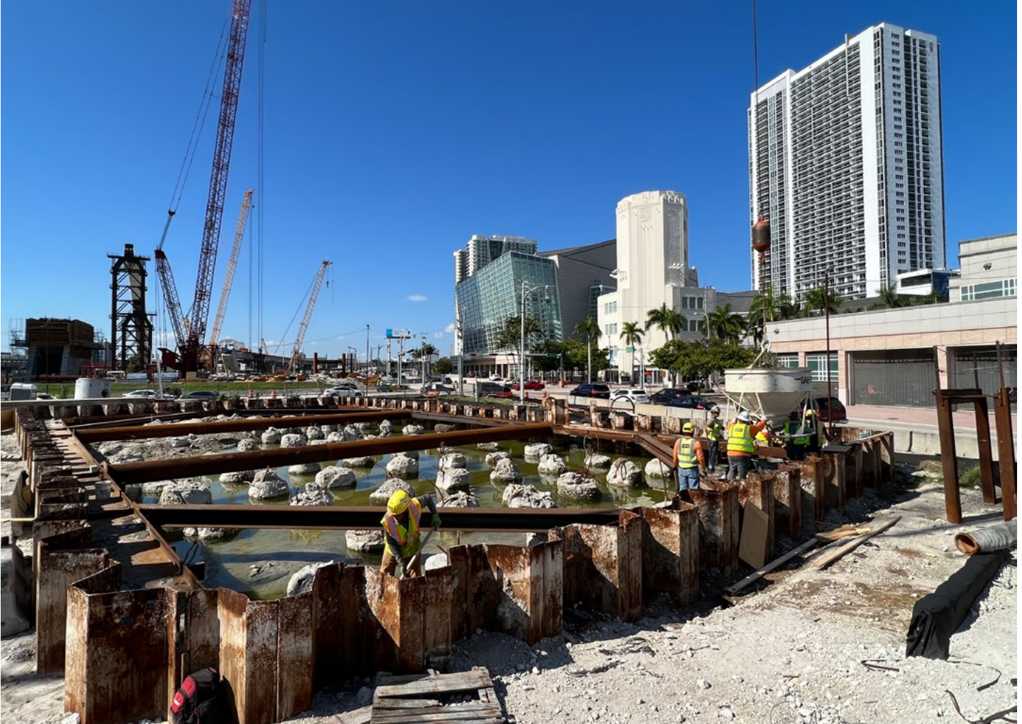
Concrete pour at one of the signature bridge arch footers just east of Biscayne Boulevard