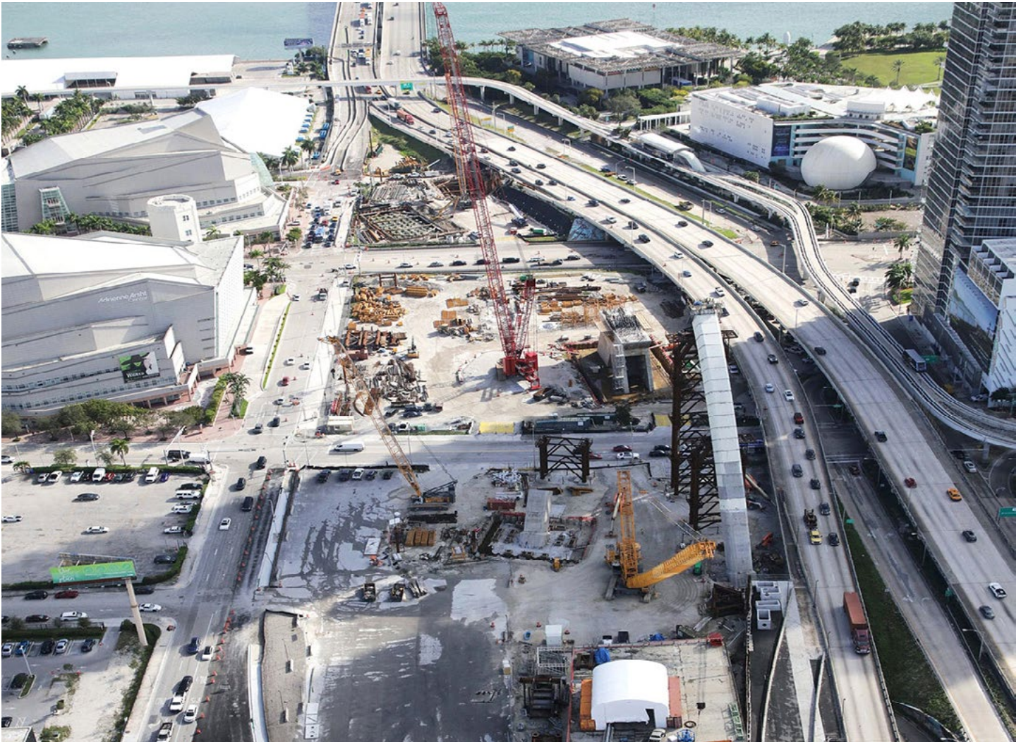
Ongoing work at the I-395 signature bridge