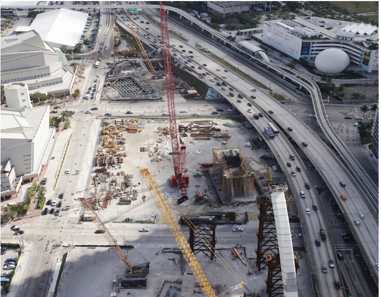
I-395 signature bridge center pier and arches under construction