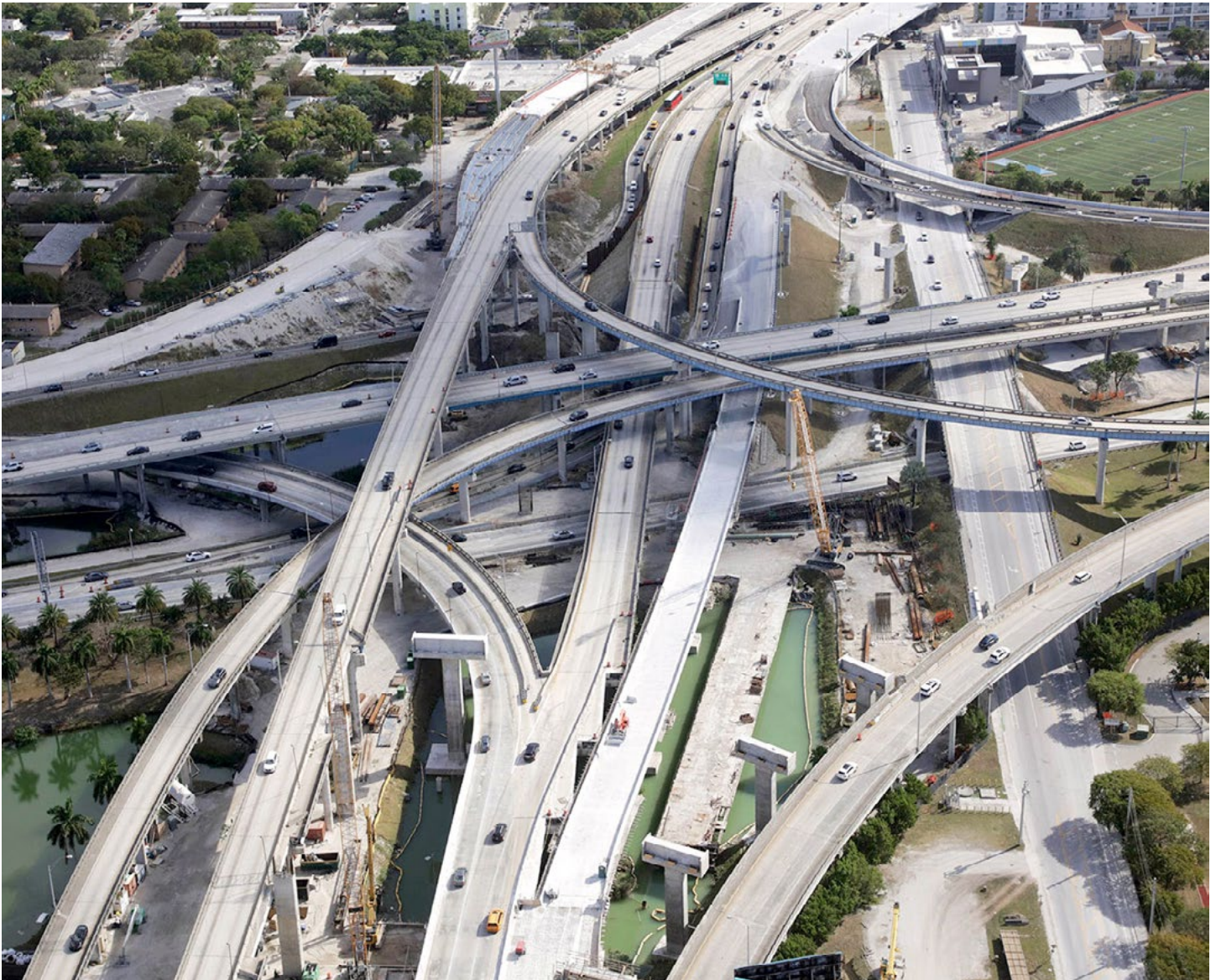
Core of the interchange showing ongoing bridge and roadway construction