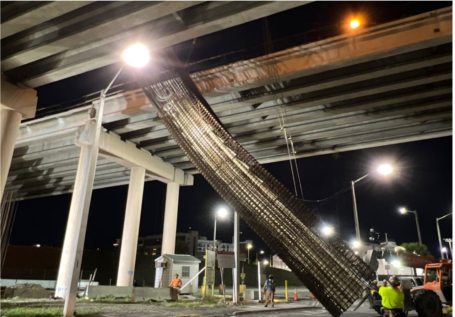
Pier construction for the new SR 836 double decked section adjacent to NW 13 Avenue