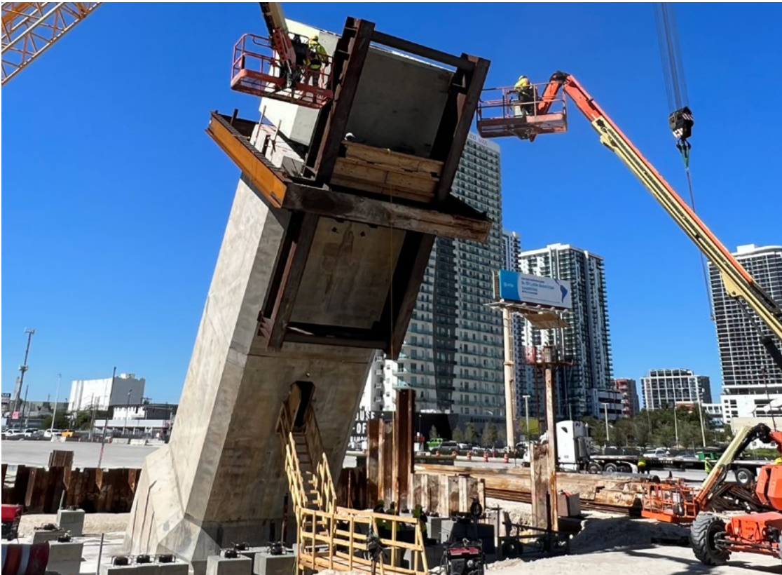
Start of arch segment installation at a second signature bridge arch west of NE 2 Avenue