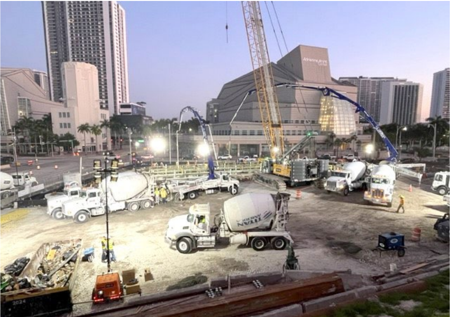
Concrete pour for the floor of one of the signature bridge arch footers.