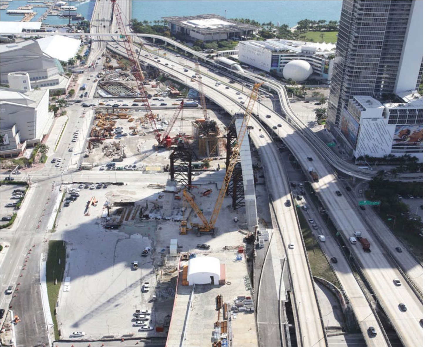
Signature bridge arches and center support pier under construction.