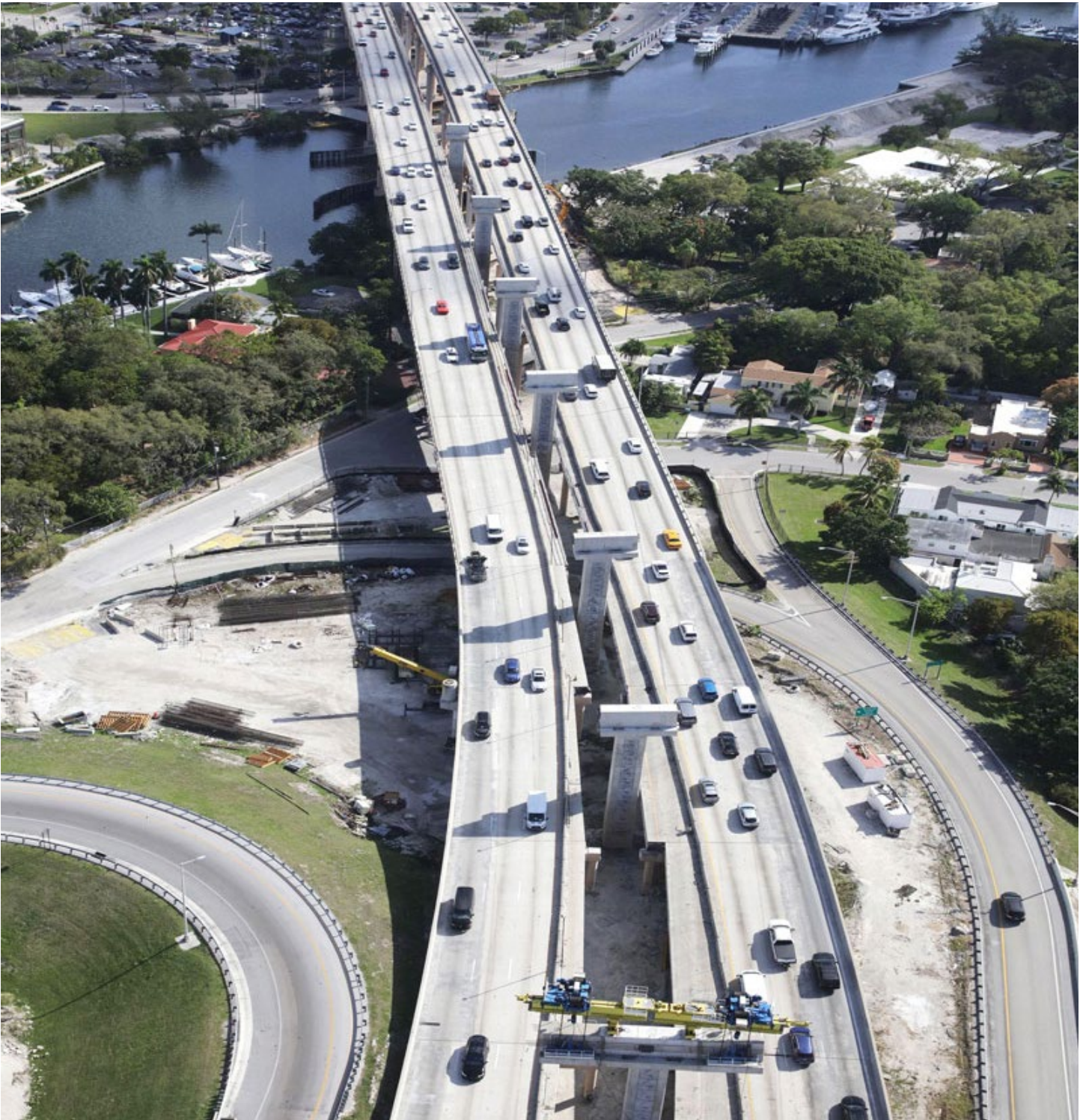
Piers for the new double decked roadway east of NW 17 Avenue.