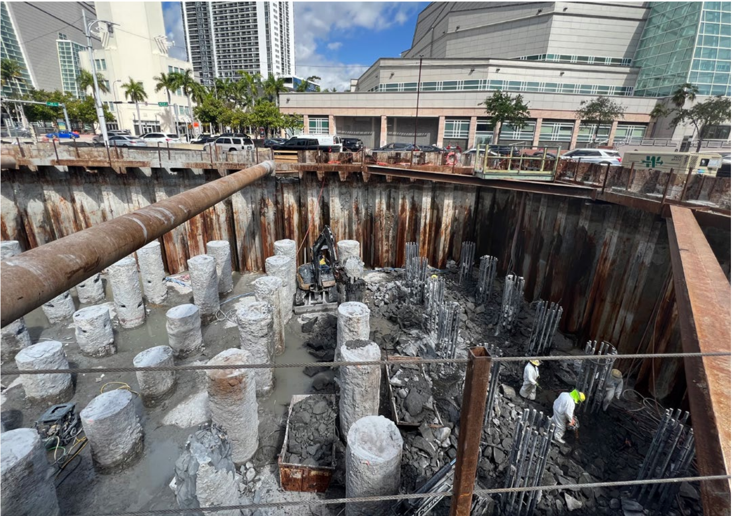
Crews chipping at the auger cast piles at one of the arch foundations in preparation of reinforcing steel installation