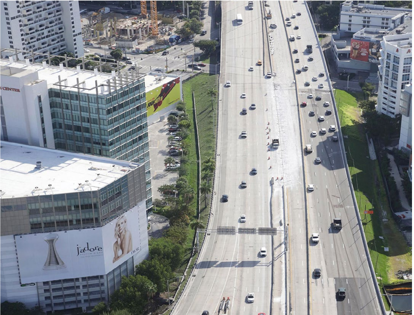
Work zone in the median of SR 836 for foundation work