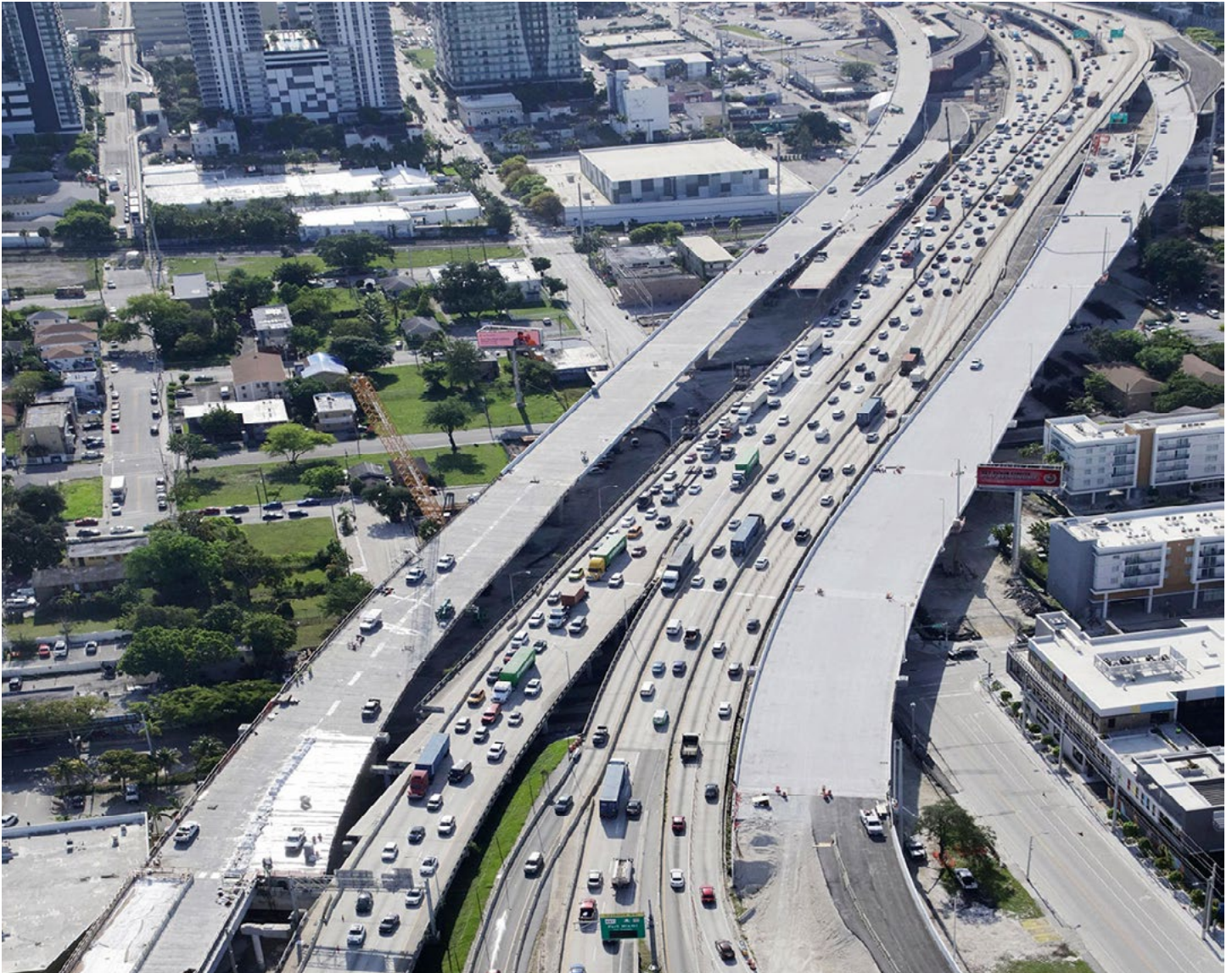
New I-395 eastbound and westbound segmental bridges