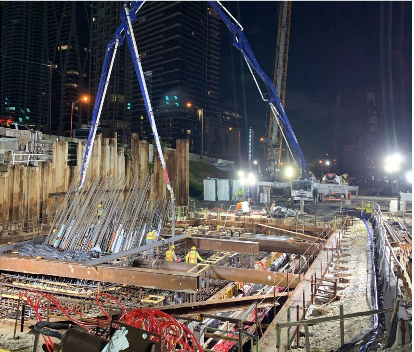
Concrete pour at the signature bridge arch footer located just east of Biscayne Boulevard and north of I-395