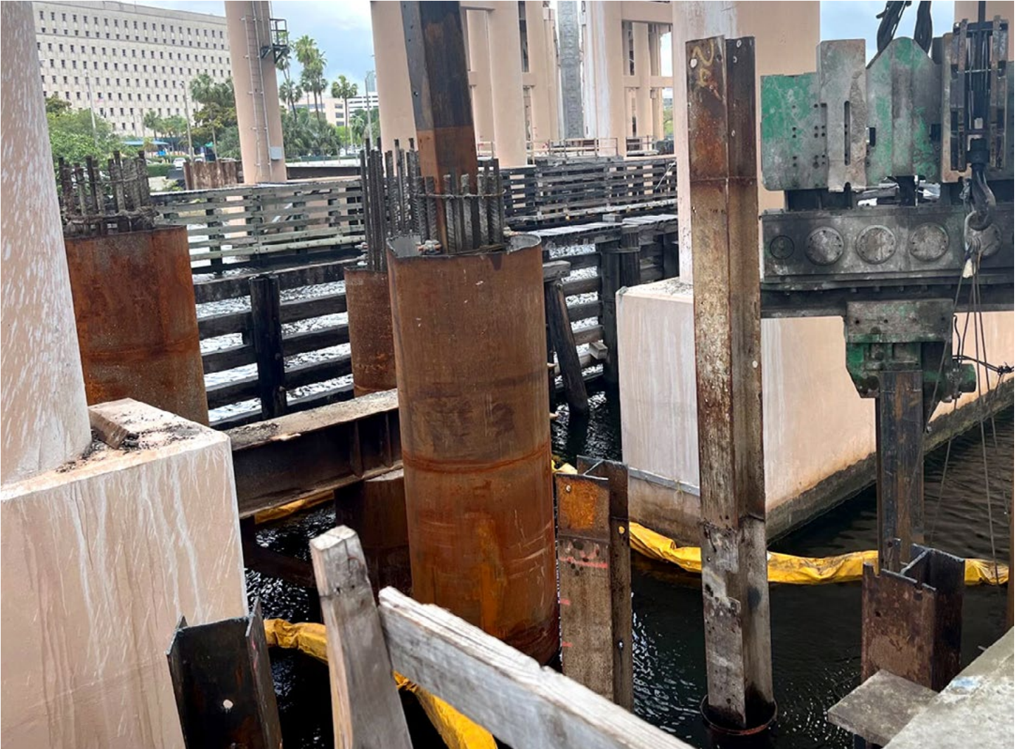
Drilled shaft foundation work in the Miami River for the new SR 836 double decked section