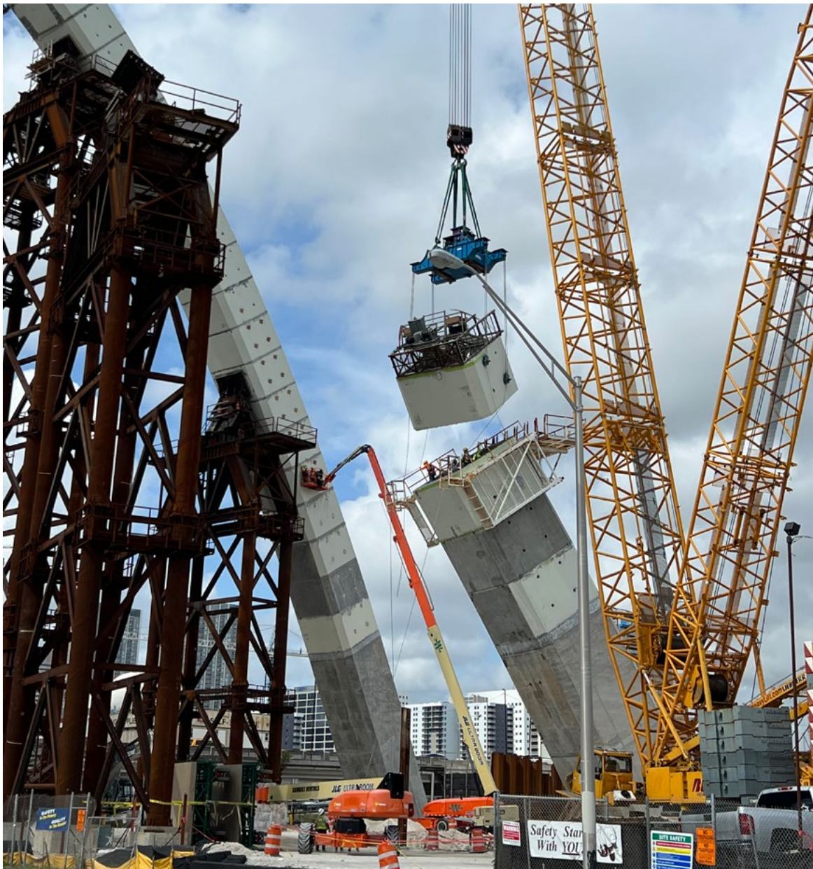
Installation of a signature bridge precast arch segment just west of NE 2 Avenue